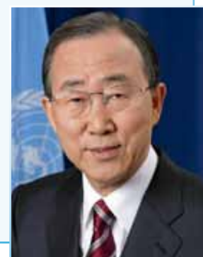
Ban Ki-moon Secretary General United Nations

“The responsibility for the future lies in our hands. Let’s begin change at home.”